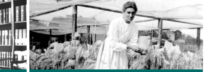
Campus life in the 1930s

The biochemist and cancer researcher Otto Warburg