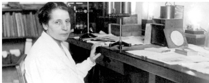
A pioneer in nuclear physics: Lise Meitner