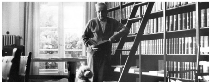
The biochemist and cancer researcher Otto Warburg