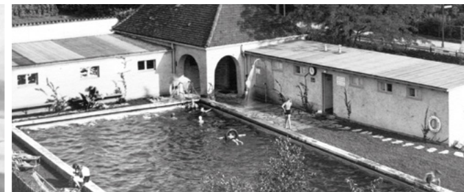
The swimming pool in Garystraße