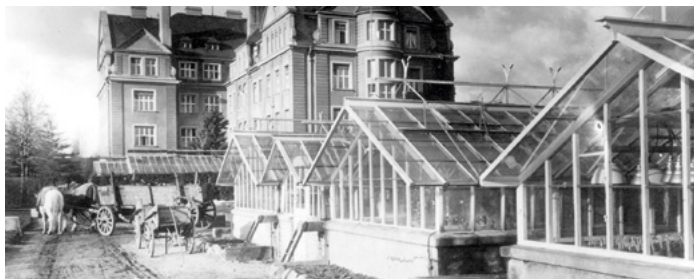
The greenhouses of the KWI for Biology