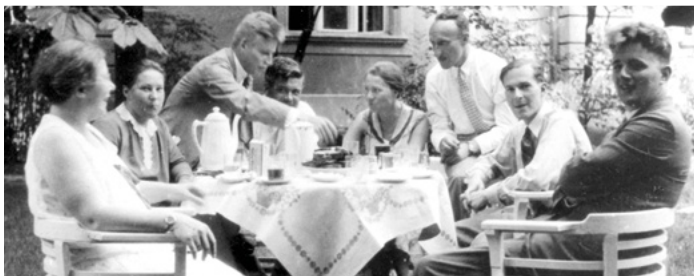
Campus life in the 1930s