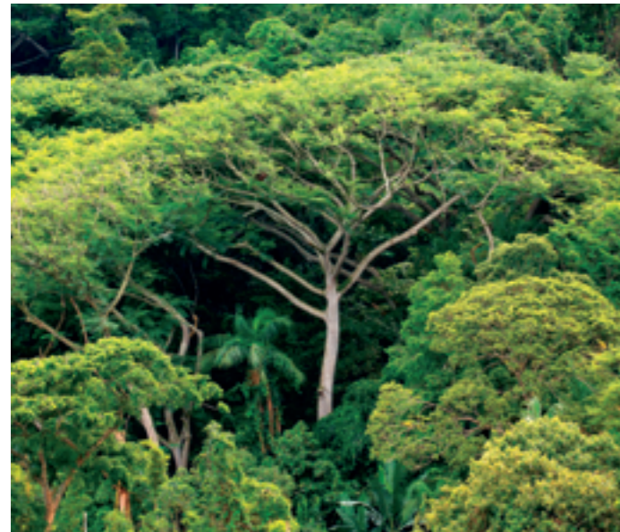
Sensitive ecosystem: For many years, Max Planck researchers working in Manaus have been investigating the significance of the tropical rainforest for the global climate.

The question of how to put a stop to climate change is taxing more than a few politicians at present. The issue has taken Federal President Horst Köhler as far afield as Amazonia: during a state visit to Latin America, he sought advice from an expert group of Max Planck scientists on what politicians in Germany and worldwide can do to mitigate the effects of our changing climate. The Max Planck Society has for many years maintained a tropical outpost in Manaus, Brazil.