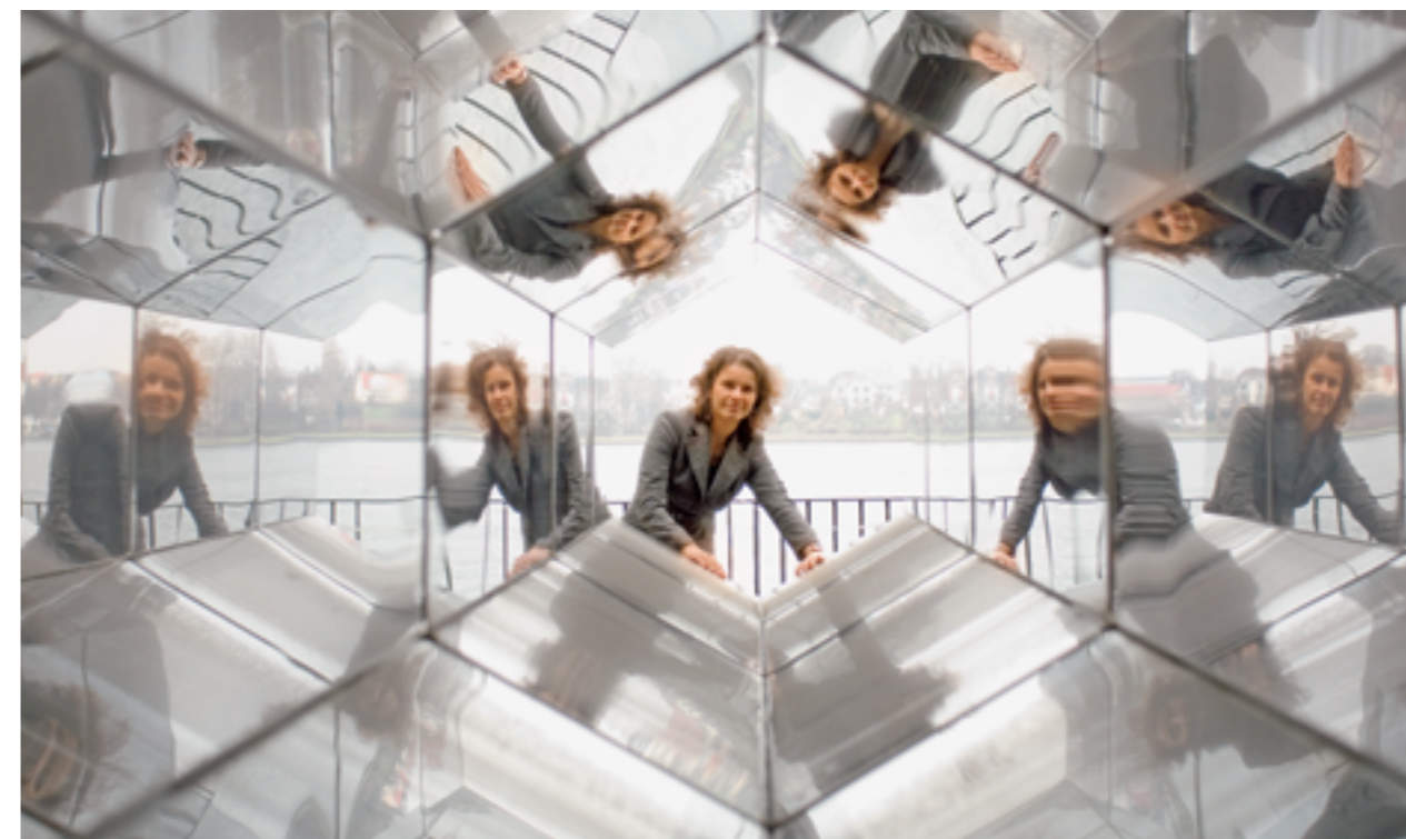
Demographic researchers see society as somewhat akin to a kaleidoscope. From this perspective, the sculpture on the institute's terrace has a certain symbolic power.

research institutes in the social sciences there.