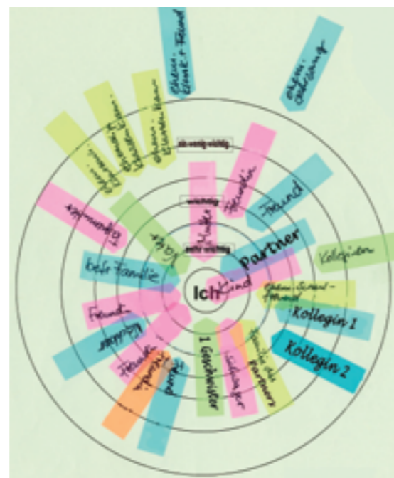
The color of relationships: The women interviewed arranged people around them according to how close they were to them.