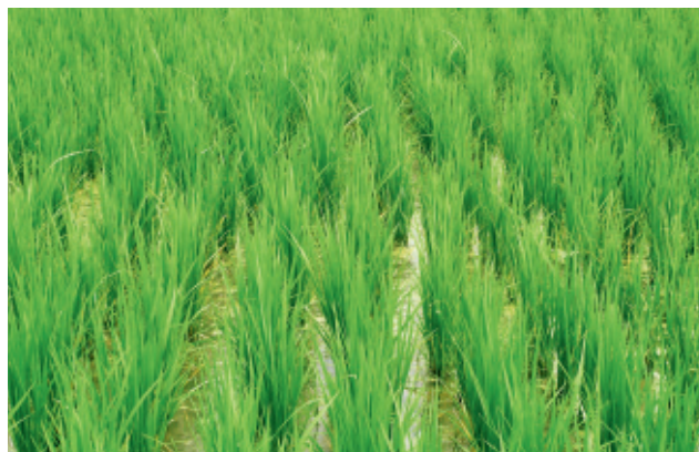
A boost for rice cultivation: Artificial RNA snippets accelerate the breeding of varieties with new properties.

Researchers in Tübingen easily and efficiently inactivate genes that impart unwanted characteristics