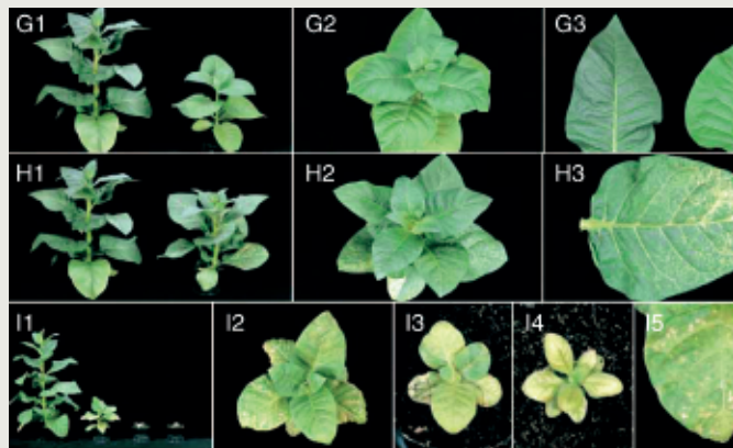
Little genetic activity: Tobacco plants that form fewer proteins stay small, the leaf veins turn yellow or the leaf tissue dies.

Genetic analysis from basic research delivers new targets