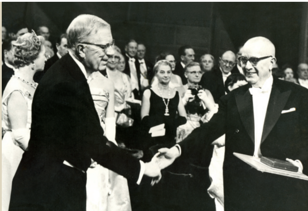
King Gustav VI. Adolf of Sweden (left) congratulates Karl Ziegler on winning the Nobel Prize for Chemistry in 1963.

their scope, or even to attack their entire legal validity. After all, there was a lot of money involved.