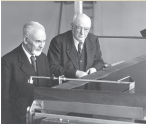
This photo, taken in July 1950, shows the pioneers of aerodynamics, Ludwig Prandtl (left) and Albert Betz, by the shallow water tank at the Max Planck Institute for Fluid Dynamics, watching eddies form behind objects as water flows around them.