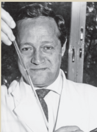
At the heart of (metabolic) events: Feodor Lynen and acetyl-CoA, “activated acetic acid.” The picture was taken in October 1964, just a few weeks before Lynen was awarded the Nobel Prize.

The memorable moment when he discovered the answer was later described by Lynen in the following terms: “My brother-in-law, Theodor Wieland, was spending the holidays at his parents’ house, which is next door to our house. He had been [...] working on pantothenic acid, the vitamin that Lipmann had recognized as a component of coenzyme A. We spent the whole night discussing how acetate and pantothenic acid could be bound to each other, but we did not