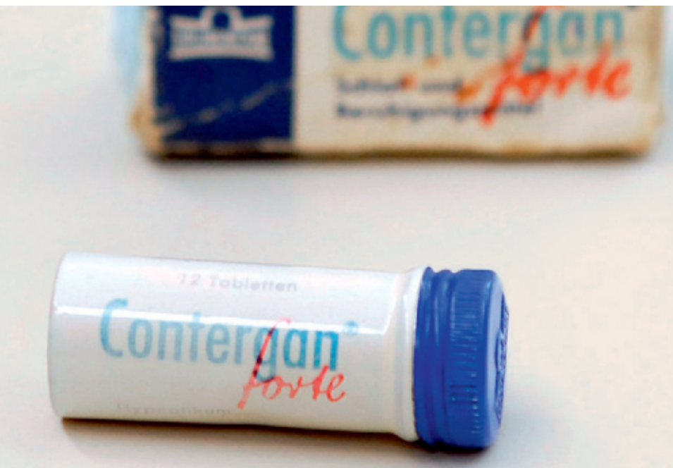
Scandals such as those provoked by thalidomide (also branded as Contergan, above) and the Trovan trials on child patients in Nigeria (top photo shows a demonstration against the Pfizer group) serve as examples of the moral failings of pharmaceutical companies.

Mira Chang proposes that, in the case of drug trials, the buck should stop with the pharmaceutical company conducting the trial. Conducting a trial conveys an obligation. What's more, the party conducting the trial should be responsible for other things as well, such as proper follow-up care for the patient. That, too, is not a matter of course.